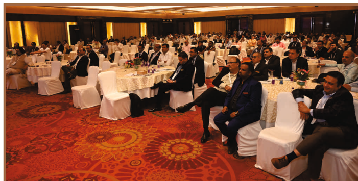
The august IPCA gathering

Another attraction was Mega Lucky draw which was presented much to the delight of the audience who waited with abated breath to hear their names.