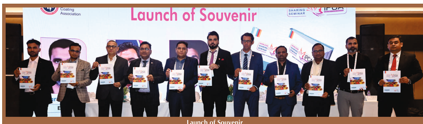
Launch of Souvenir

A key moment of the seminar was the launch of the "Souvenir," a special publication that captured the essence of