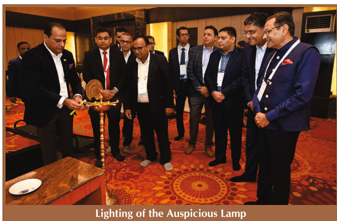
Lighting of the Auspicious Lamp

THE IPCA Western UP Ghaziabad Region Knowledge Sharing Seminar (KSS) was held on July 27, 2024, bringing together industry professionals and experts for a day of learning, networking, and collaboration. The event, meticulously organized by the Indian Paint and Coating Association (IPCA), Western UP Ghaziabad Seminar Committee 2024, began with the invocation and lighting of the lamp, symbolizing the start of an enlightening day.