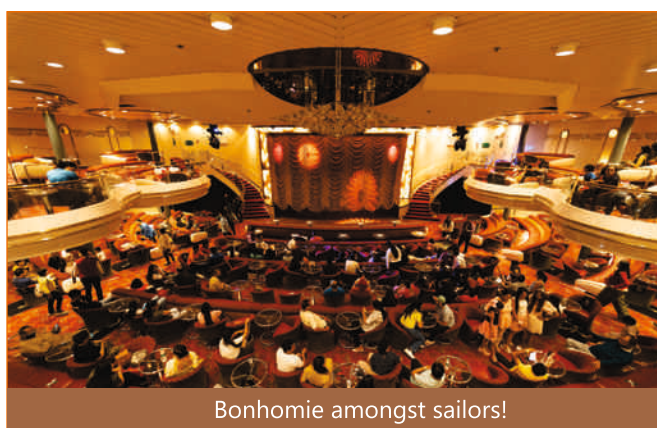
Bonhomie amongst sailors!