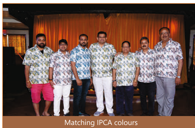
Matching IPCA colours