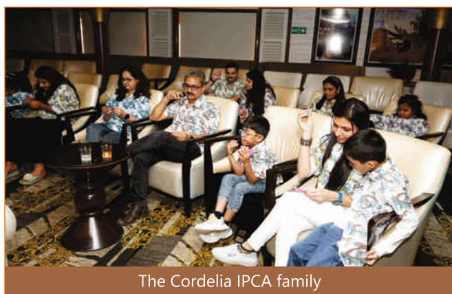
The Cordelia IPCA family