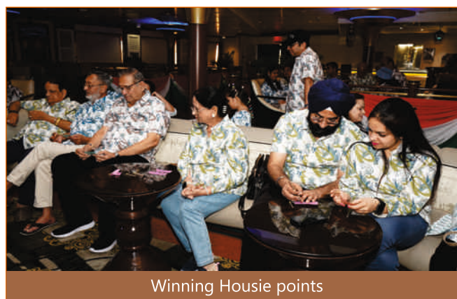
Winning Housie points